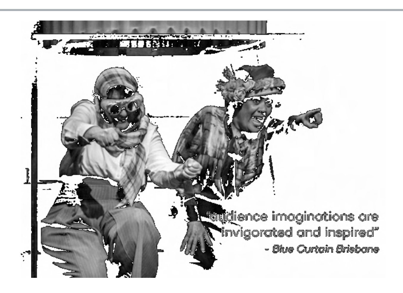
"This is theatre at its best". - Australian Stage